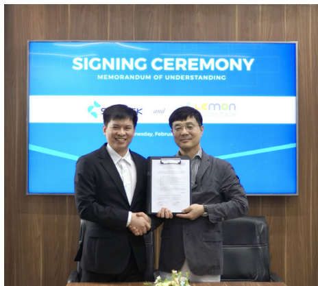
LEMON HEALTHCARE (KR) & SOTATEK (VN)