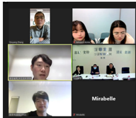
ROWAN (KR) & SUNWAH GROUP (CN)