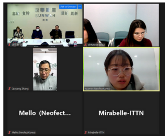
NEOFECT (KR) & SUNWAH GROUP (CN)