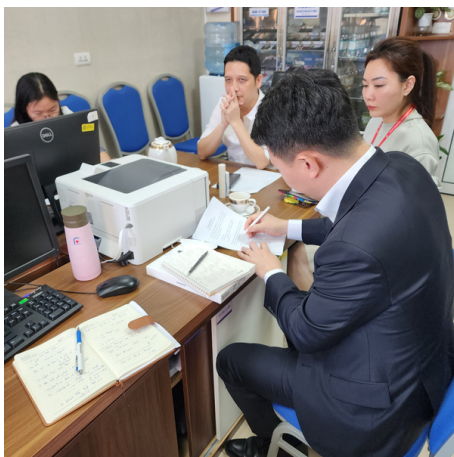
BREATHINGS (KRC) & HANOI HOSPITAL (VN)