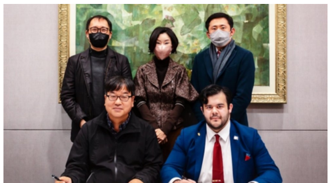
WANNABE CHAIN (KR) & CLOUDYBOSS (US)